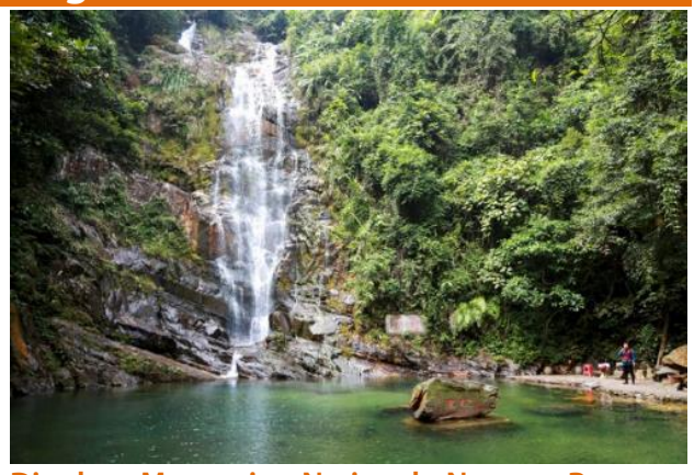
Dinghu Mountain National Nature Reserve Reputed as the "Emerald on the Tropic of Cancer", Dinghu Mountain National Nature Reserve is among the first batch of national nature reserves in China and a biosphere reserve observatory under the UNESCO's Man and the Biosphere Programme.

Alternatively, you may take a 44-minute taxi ride from Zhaoqingdong Station.