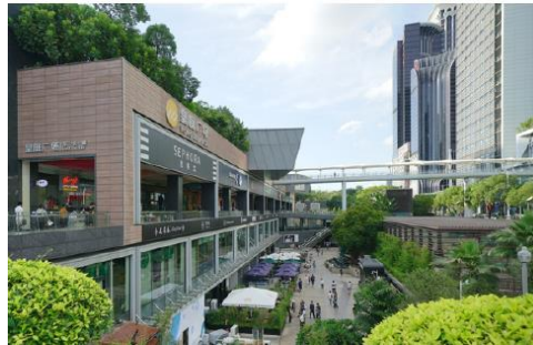
Wong Tee Plaza

Address: 3/F, COCO Park, Fuhua Third Road, Shenzhen